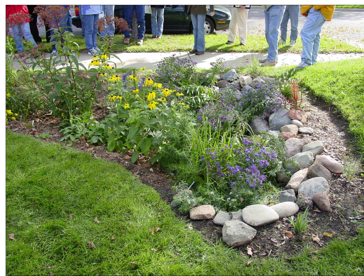
RAIN GARDEN EXAMPLE

C Remove and haul 2 rows of ties in their entirety closest to Clark property. Replace removed ties with new composite ties and install new composite ties