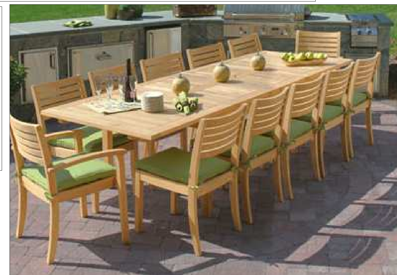
TABLE AND CHAIR SAMPLES