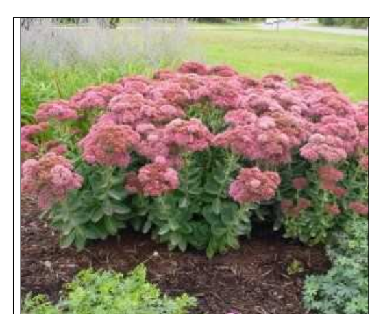
AUTUMN JOY SEDUM