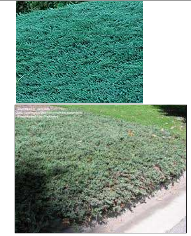
Blue Rug Juniper 18" mature height