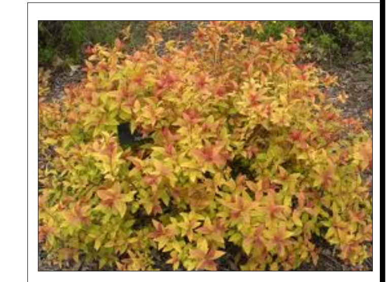
Goldflame Spirea 32" mature height