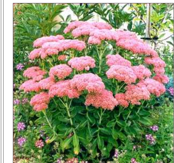
Autumn Joy Sedum 2' mature height