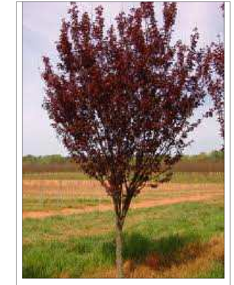
Purpleleaf Plum 15' mature height (2 existing)