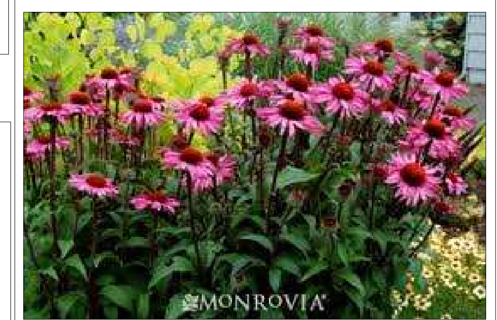
Coneflower (Orange or Pink) 2' mature height