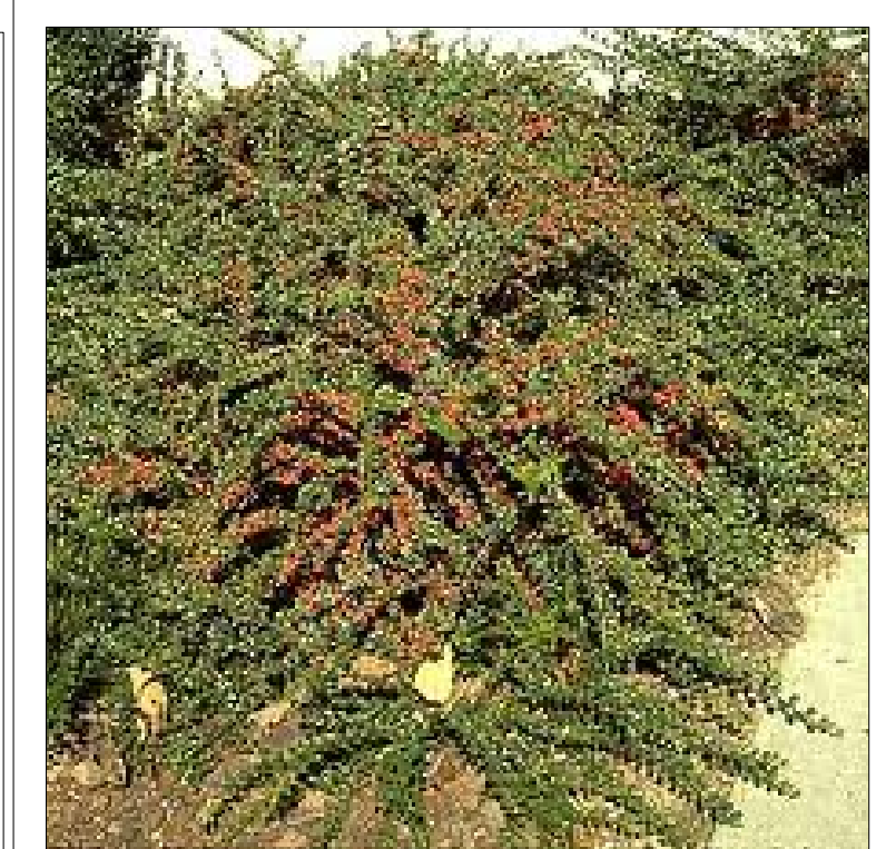
Cotoneaster 2' mature height, 30" spread