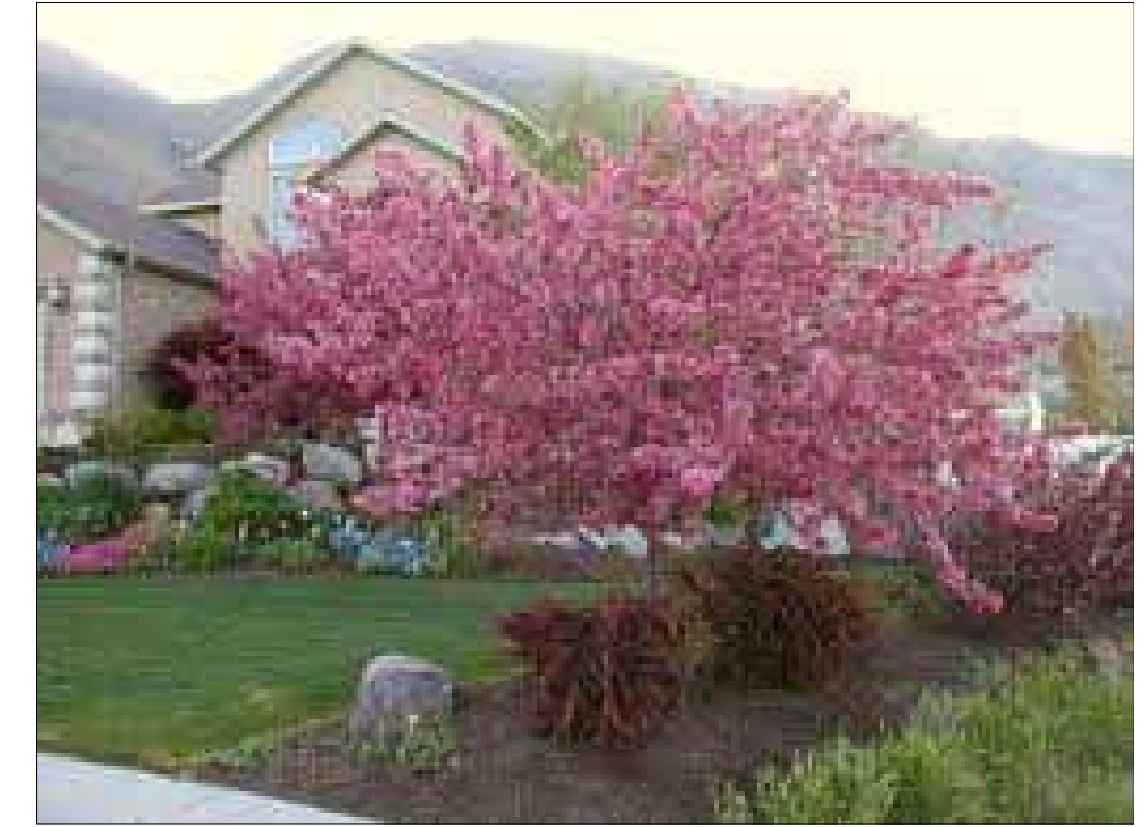
Prairiefire Crab 15' mature height